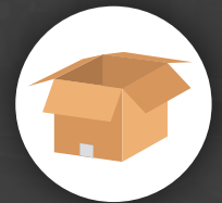
BOTTOM SEAL ONLY