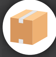
TOP & BOTTOM SEAL