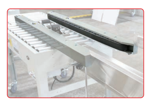
EXTENDED SIDEDRIVE BELTS

Gently pulls product through while reducing less wear & tear on parts.