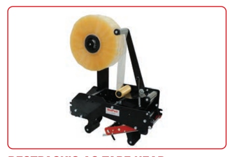
BESTPACK'S AC TAPE HEAD

Gently pulls product through while reducing less wear & tear on parts.