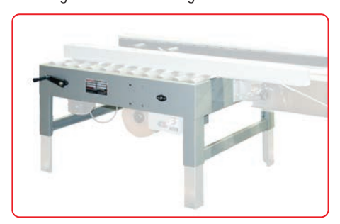
CNC CUT AND WELDED FRAME/LEGS

Manual erecting solution creates an all-in-one erecting and bottom sealing solution.