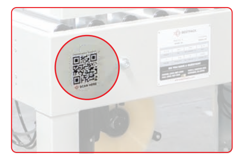
ACCESSIBLE TECHNICAL SUPPORT

Eliminates repetitive manual folding of bottom flaps, improving worker efficiency.