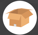
BOTTOM SEAL ONLY