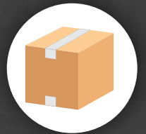
TOP & BOTTOM SEAL