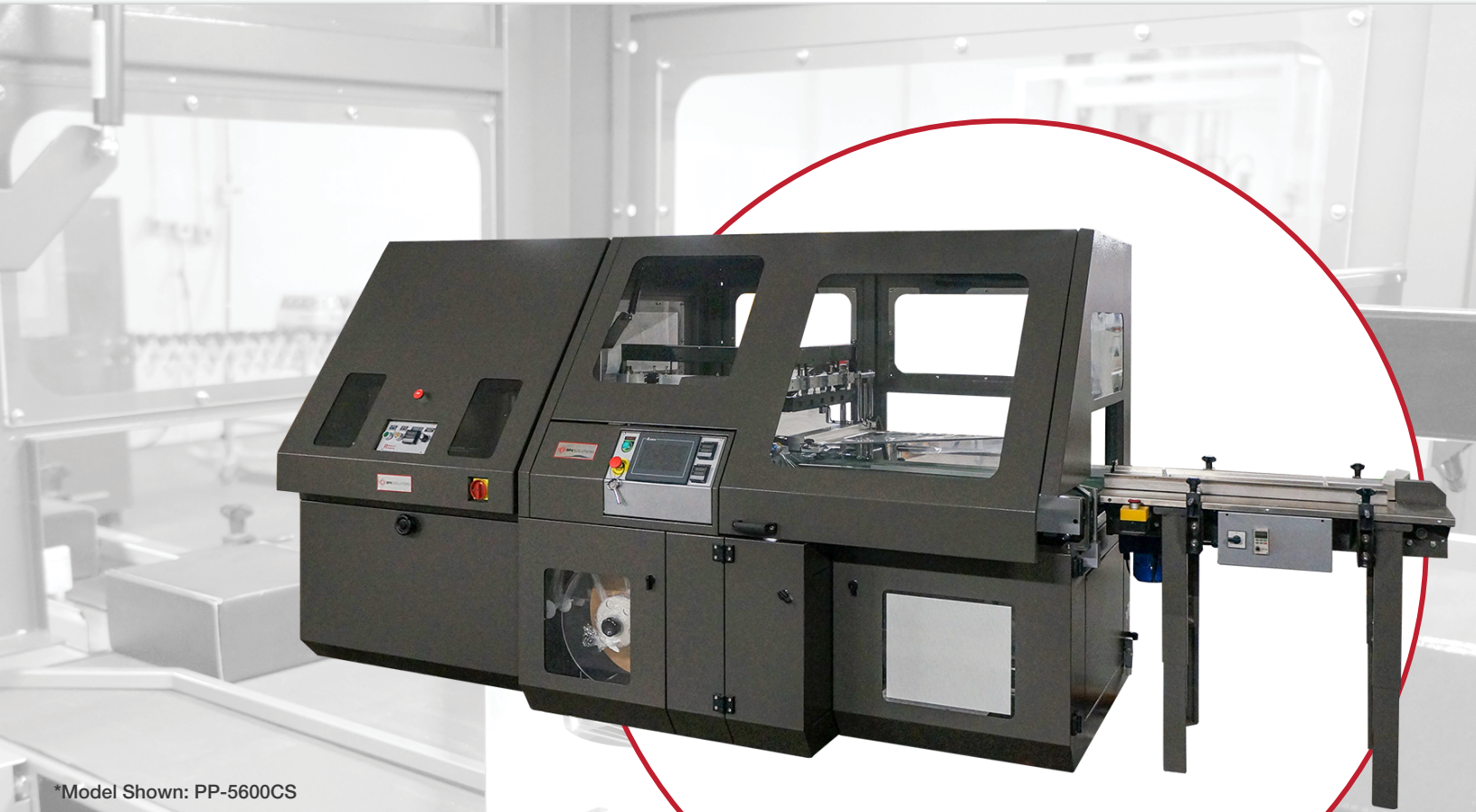
*Model Shown: PP-5600CS