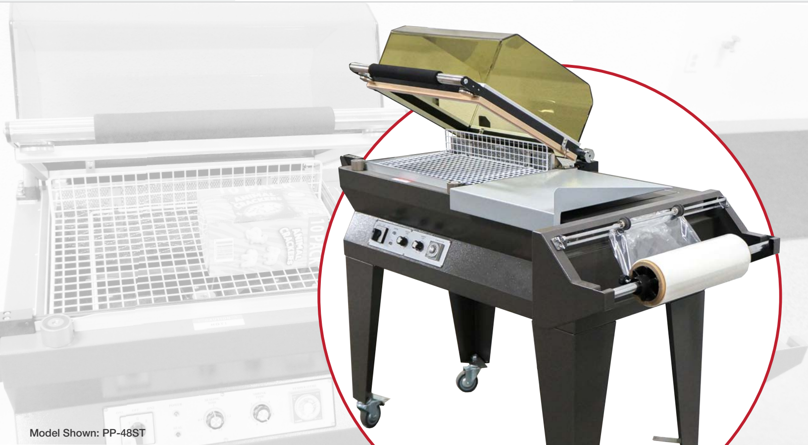
Model Shown: PP-48ST